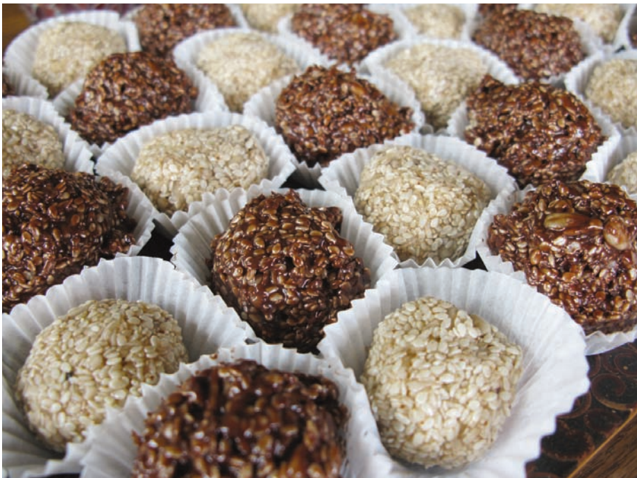
Chocolate-Sesame Bonbons • page 262