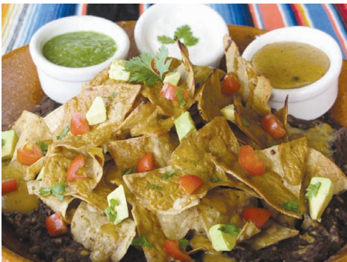
We Will Rock You Three-Layered Nachos • page 242