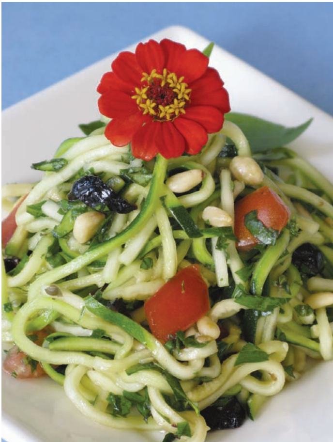
Raw Pasta Puttanesca • page 202