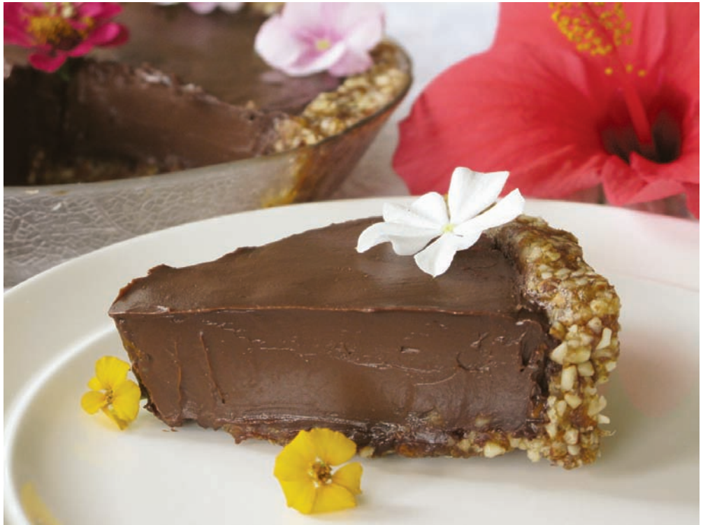
Chocolate Ganache Pie • page 272