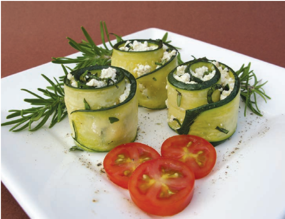
Zucchini Roll-Ups • page 295