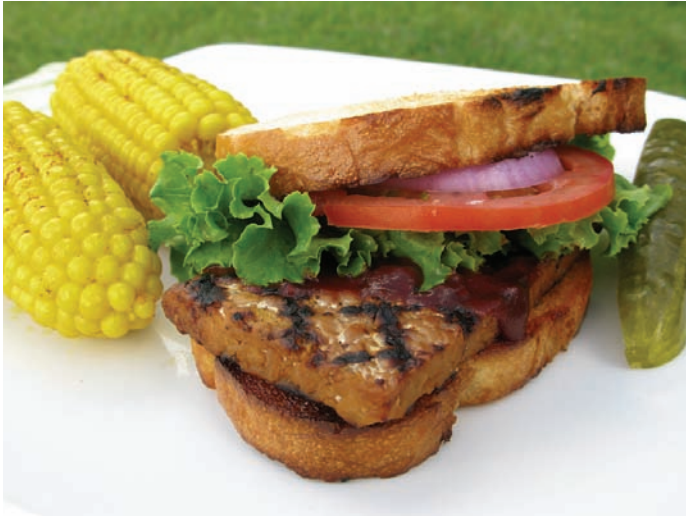
BBQ Tempeh Sandwich • page 123