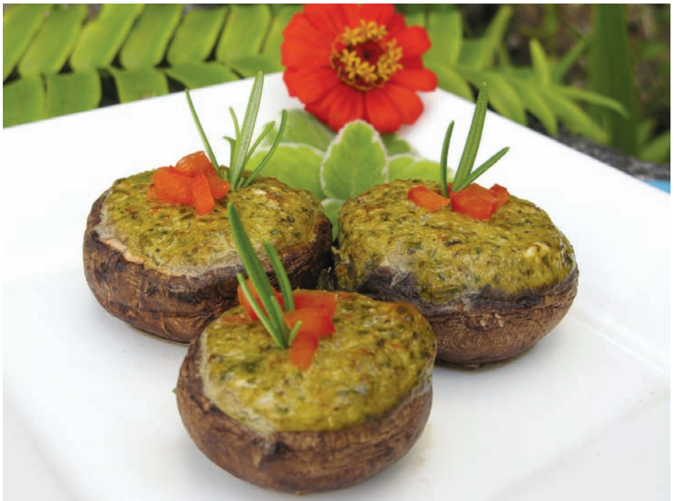
Stellar Stuffed Mushrooms • page 188