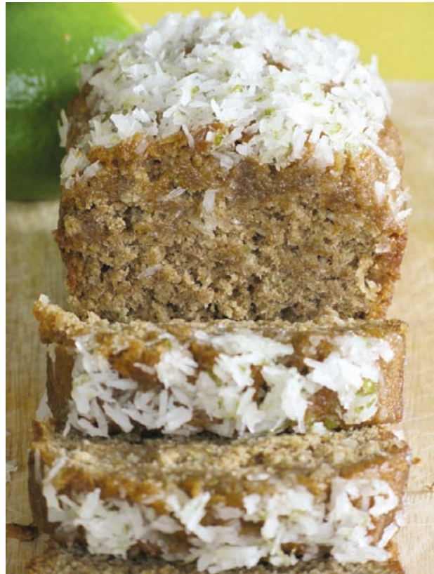
Coconut-Lime Banana Bread • page 72