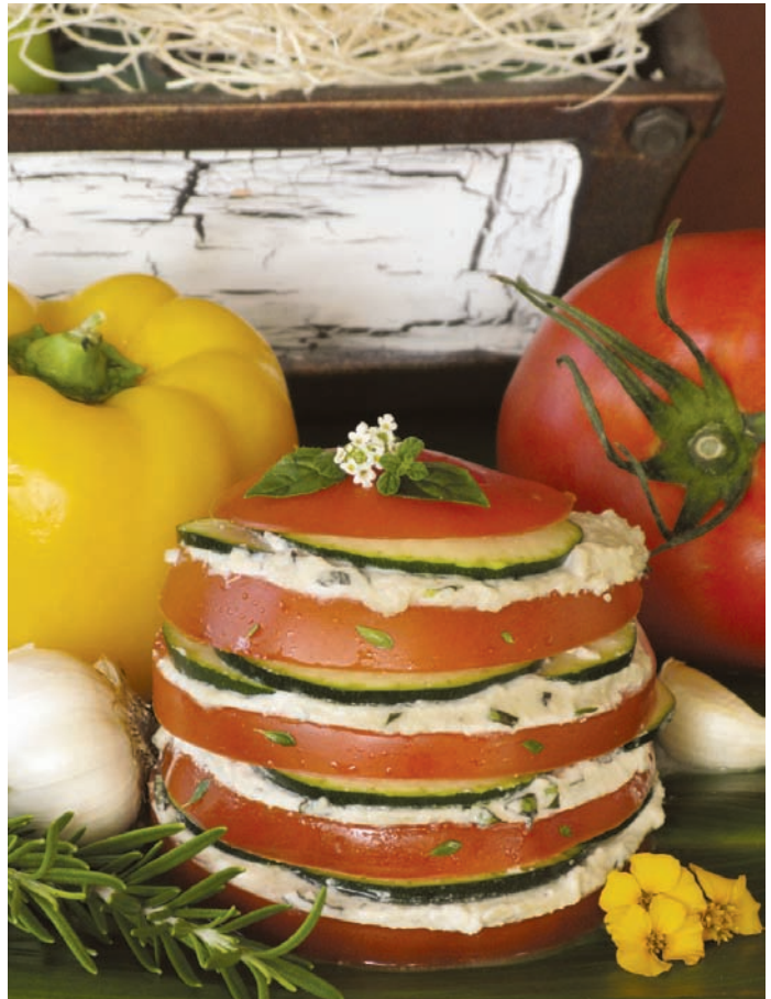
Live Macadamia Nut-Ricotta Veggie Towers • page 219