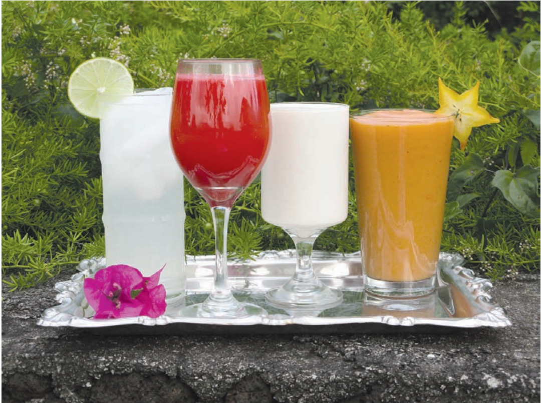
Lovely Limeade • page 38, Watermelon Cooler • page 45, Almond Butter Smoothie • page 51, and Tropical Smoothie • page 47