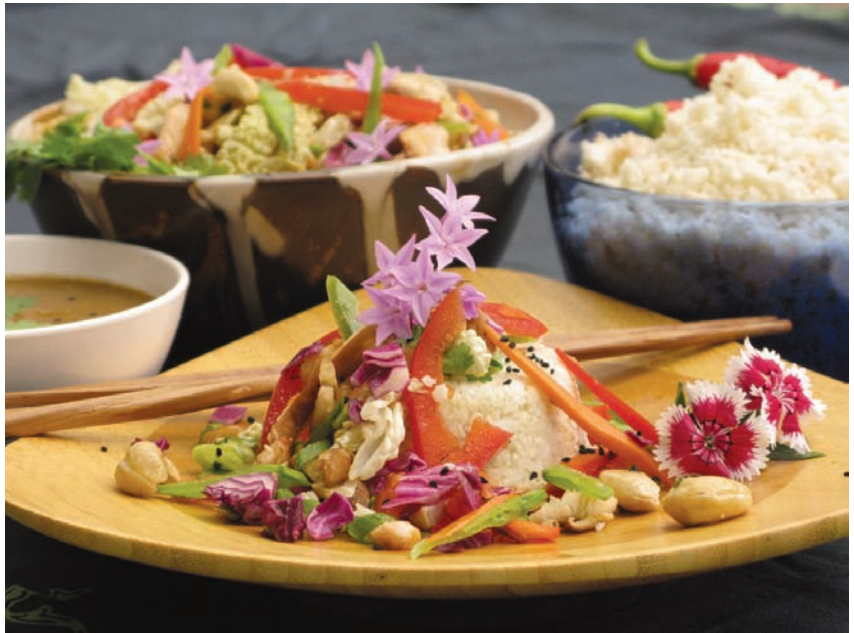
Live Un-Stir-Fry with Cauliflower Rice • page 198