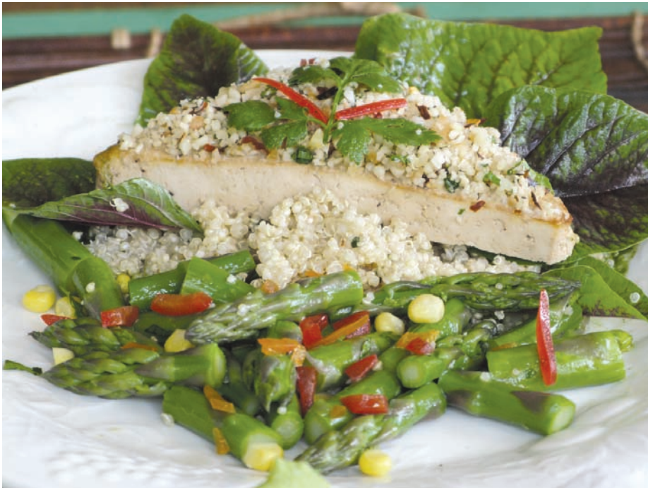
Macadamia Nut-Crusted Tofu • page 224