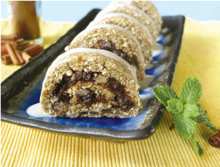
Live Cinnamon Rolls • page 69