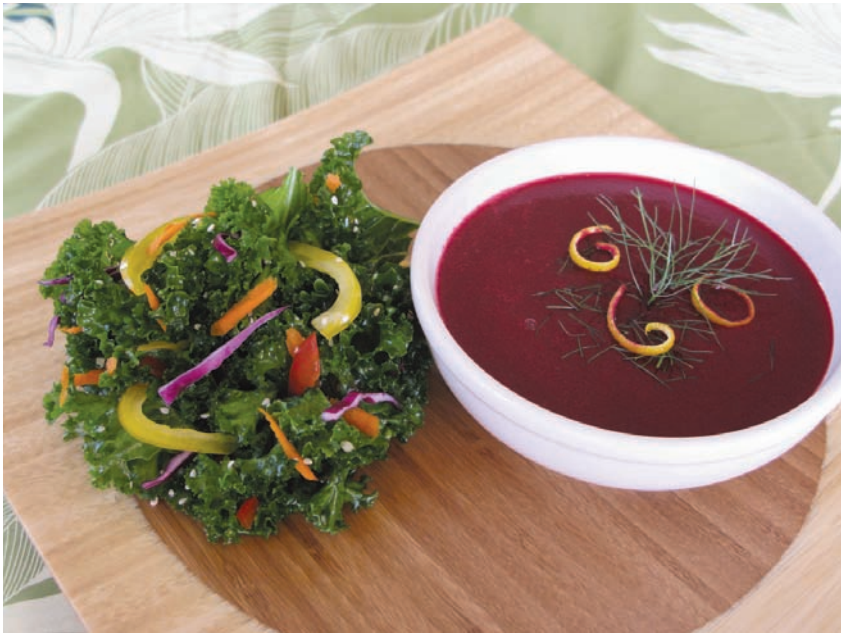
Rainbow Kale Salad • page 138