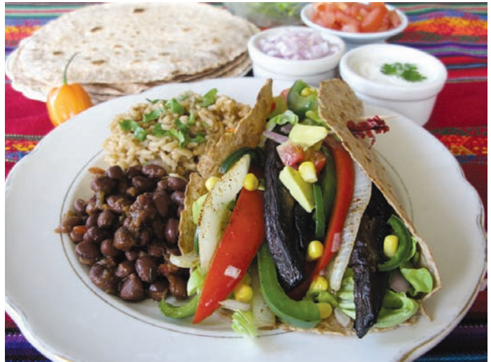
Fajitas Bonitas • page 217