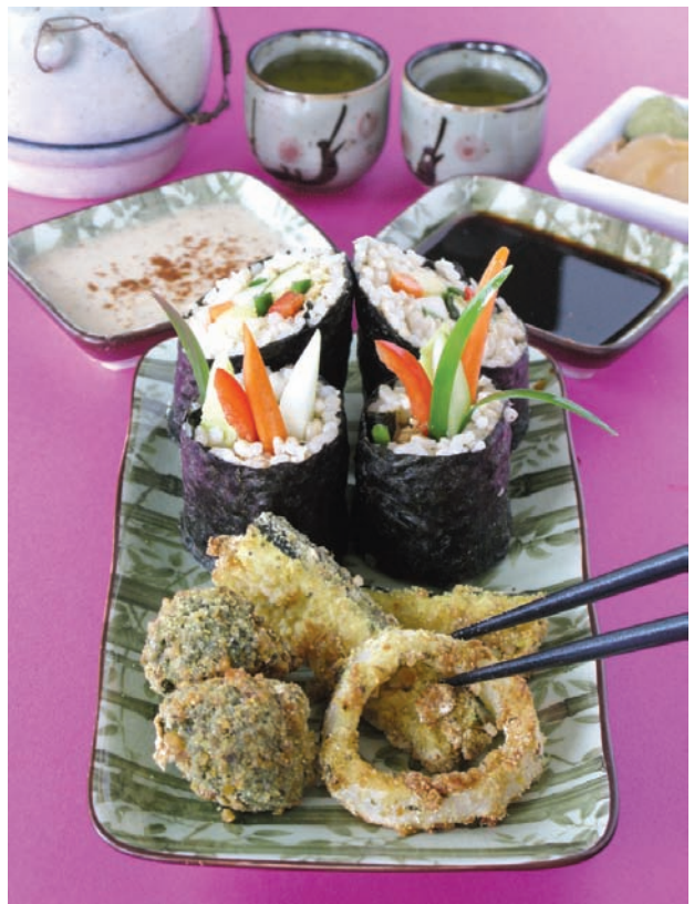
Sushi Nite • page 206 Plain-Jane Roll • page 207 Asian Dream Roll • page 207 Asparagus Roll • page 207